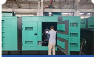
5. Generator assembly