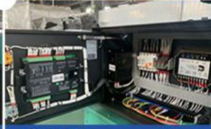
6. Wiring connection