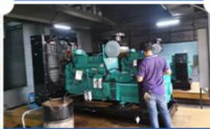
8. Generator testing