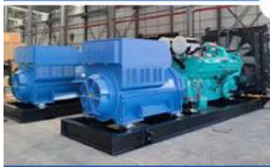
7. Diesel generator