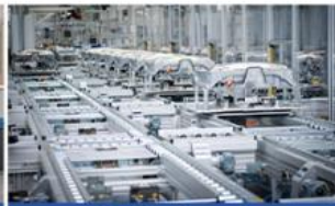
3. Fuel tank